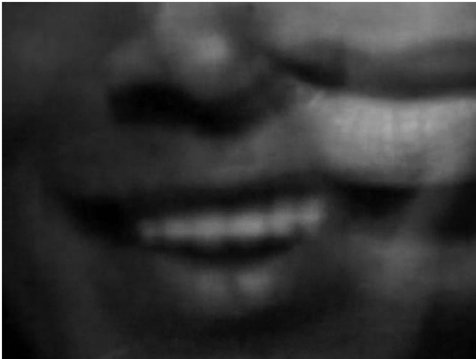
Figure 1. A meeting of mouths, from Natalie Cole, Unforgettable, directed by Steve Barron. New York: Elektra Video, 1991.